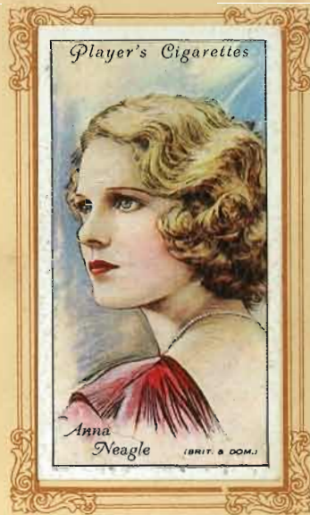
A NNA NEAGLE ( British and Dominions ) was born in Forest Gate on October 20th, 1908, and christened Marjorie Robertson. Educated at St. Albans High School, she began her career as a teacher of gymnastics and ballroom dancing, and after being a finalist in the World's Ballroom Championship, she turned to the stage and made her debut in Charlotte's 1926 Revue . While she was still in the chorus, Jack Buchanan noticed her, and she leapt to fame overnight as his leading lady in Stand Up and Sing , repeating her success with him on the screen in Good-night Vienna . Bitter Sweet , The Queen's Affair and Nell Gwynn are her later pictures. (No. 33.)