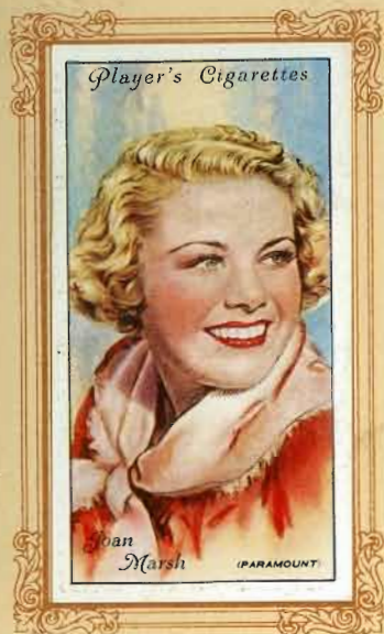
J OAN MARSH ( Paramount ). Born on July 10th, 1914, in the San Joaquin Valley, California, this famous film star was christened Nancy Ann Rosher. Her father was Charles Rosher, a well-known camera-man who at one time photographed Mary Pickford's films. Nancy began her film career when nine months old, but left the screen when she was seven to be educated. When she was fifteen, she returned to the studios and adopted her present name, Joan Marsh. She specializes in tap and acrobatic dances, but she seldom displays this talent in her films, the latest of which include Rainbow Over Broadway and You're Telling Me . (No. 31.)