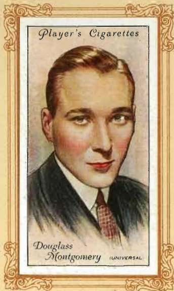
D OUGLASS MONTGOMERY ( Universal ). Born in Los Angeles on October 29th, 1907, Robert Douglass Montgomery was a prominent member of the Pasadena Community Playhouse while still at a High School. Before he was seventeen, he had won his way to Broadway, subsequently becoming a member of the famous New York Theatre Guild. In 1930 he made his film debut in Waterloo Bridge , under the name of Kent Douglass. After four pictures, he returned to Broadway, but is now back at Hollywood again. Recent successes include Little Women , Eight Girls in a Boat , Little Man , What Now? and Music in the Air . (No. 32.)